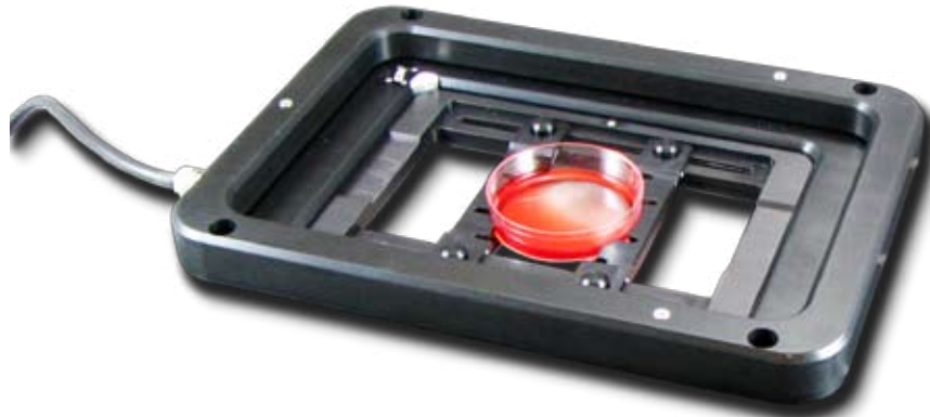
96A602 Piezo Z-stage with 99A074 adjustable insert

“The New Standard for High Performance Piezo Microscope Focusing”