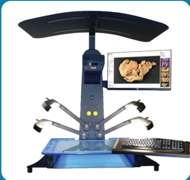
PathStand™ — Publication