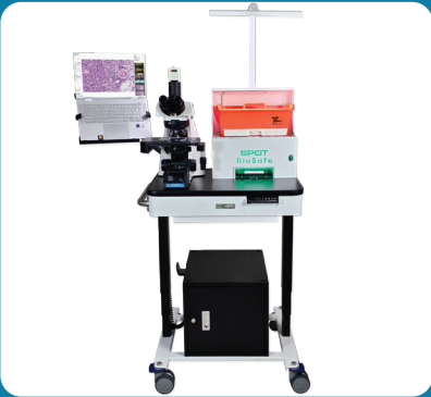
CytoXpress™ — ROSE