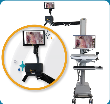
PathMobile™ — Autopsy