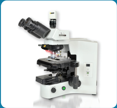
PathScope™ — Case Sign-Out

Consolidating all changes into: Designed with efficiency in mind, PathSuite Professional integrates tightly with SPOT Imaging hardware to reduce handling and speed up workflows, helping your lab do more with less.