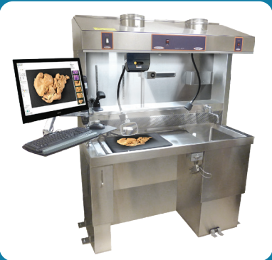
PathStation™ — Grossing